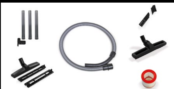
ACCESSORY KIT Ø32